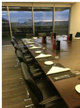
Acuity Legal Briefings..