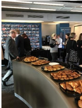
Chamber of Commerce Dinner